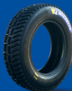
X-ICE NORTH 3

Size: 15/65-15 Conditions: ice and/or snow