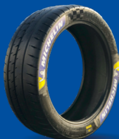
H5 (HARD COMPOUND)