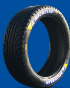
FW3 (FULL WET)

Size: 20/65-18 Conditions: icy, frosty, damp, cold conditions