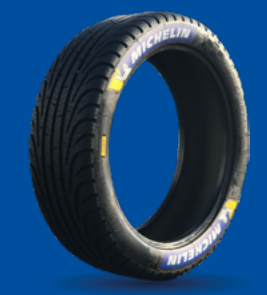
FW3 (FULL WET)

Size: 20/65-18 Conditions: icy, frosty, damp, cold conditions