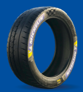
S6 (SOFT COMPOUND)

Size: 20/65-18 Conditions: wet, cold conditions