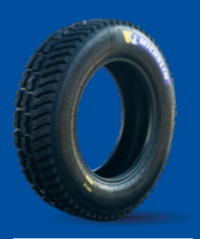
X-ICE NORTH 3

Size: 15/65-15 Conditions: ice and/or snow