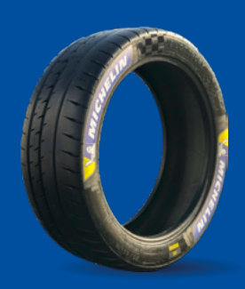
H5 (HARD COMPOUND)