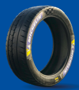
SS6 (SUPER SOFT COMPOUND)

Size: 20/65-18 Conditions: wet, cold conditions